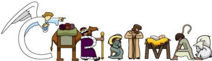
CHRISTMAS IS THE CELEBRATION OF THE BIRTH OF JESUS, THE SAVIOUR OF MANKIND