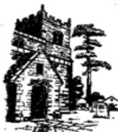
St Mary Magdalene Hemldon Wappenham