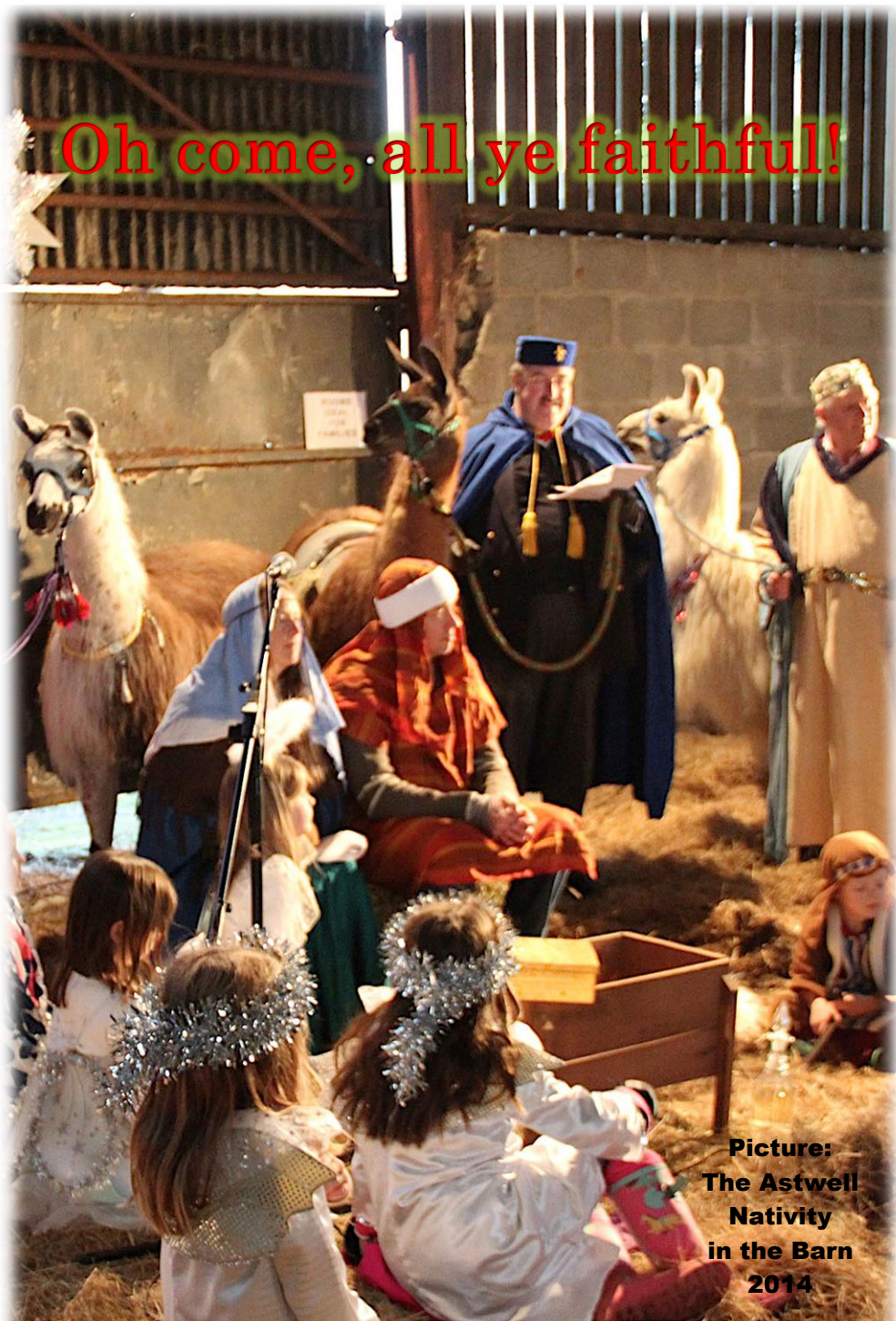
Picture: The Astwell Nativity in the Barn 2014