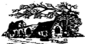
St Lawrence Radstone