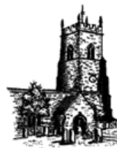
St Mary the Virgin

Did you know your Parish Church was one of six?