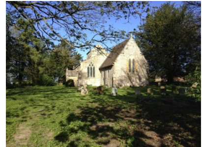
St. Mary & St. Peter, Lois Weedon & Weston with Plumpton