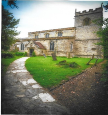
St. Mary Magdalene, Helmdon, and St. Lawrence, Chapel at Ease, Radstone