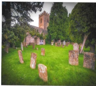
St. James the Great, Syresham