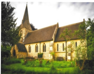
St. John the Evangelist, Whitfield